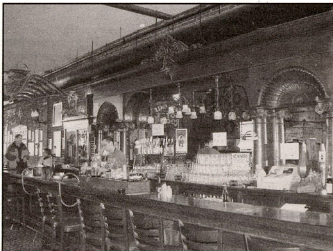
The original bar, installed in 1905, graces the White Eagle